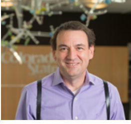
Professor of Management